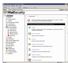
GFI MailSecurity configuration